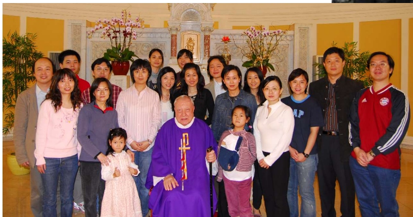
Captioned: 10 th year anniversary of UH